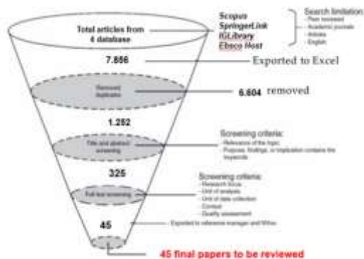
Figure 1. Data Collection Funnel

At this stage, a total of 7856 articles were obtained, which then became 1252 articles after checking for articles found to be duplicated. The third stage was to screen the titles and abstracts with the following criteria: (1) topics relevant to the research objectives, (2) objectives, findings, or implications contain keywords. So that after filtering the articles reduced to 325 articles. The last stage is to screen the full text with the criteria of (1) research focus, (2) unit of analysis, (3) data collection unit, (4) context, and (5) quality assessment. From this last stage of screening, the number of articles that became the SLR object sample was 45 articles.